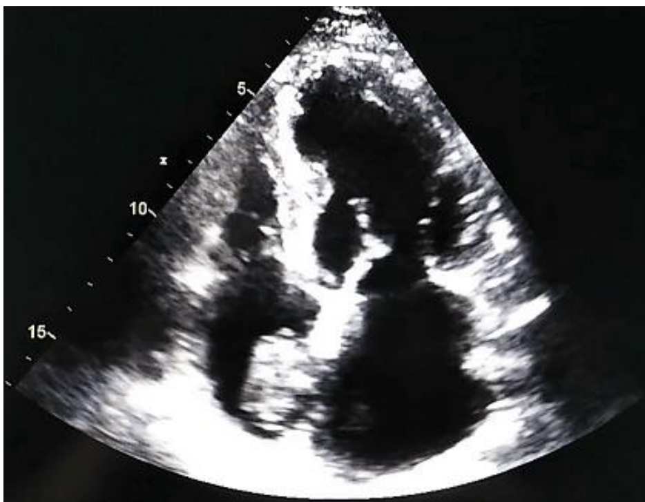
Figure 1: TTE apical four chambers view showing a thrombus in the right atrium, attached to the inter-atrial septum