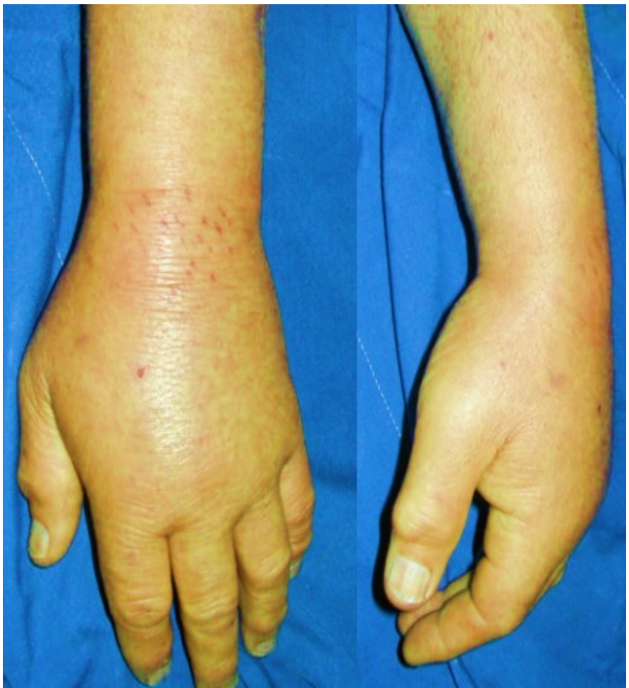
Figure 1: patient presenting with painful left wrist and fever with sequels of scarification