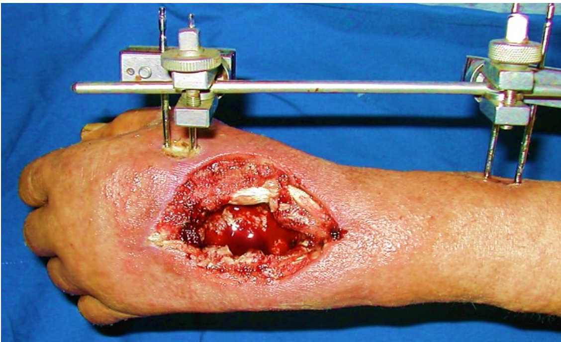
Figure 3: Immobilization with external fixator