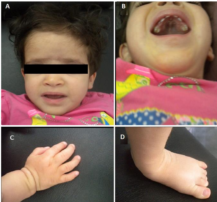
Figure 2: clinical characteristics of our patient: A) facial phenotype; B) oval palate; C) brachydactyly and clinodactyly of the fifth finger; D) valgus