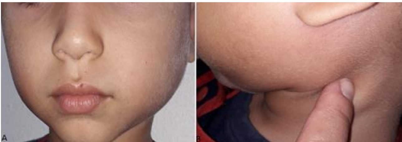
Figure 1: extraoral view, A) swelling of the left parotid region; B) presence of left cervical lymph node