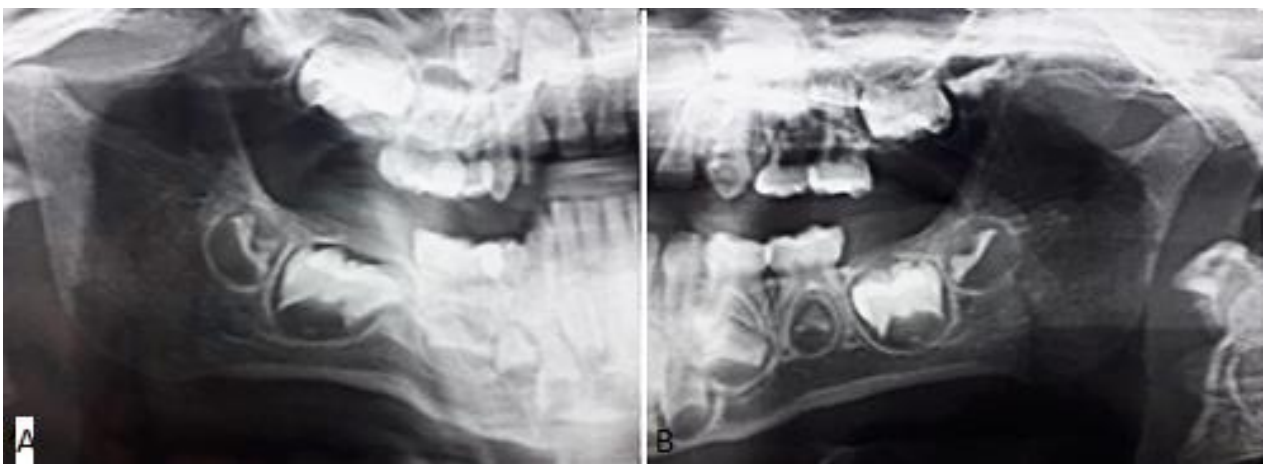
Figure 3: panoramic radiograph showing the absence of dental or alveolar bone anomalies A) right side; B) left side