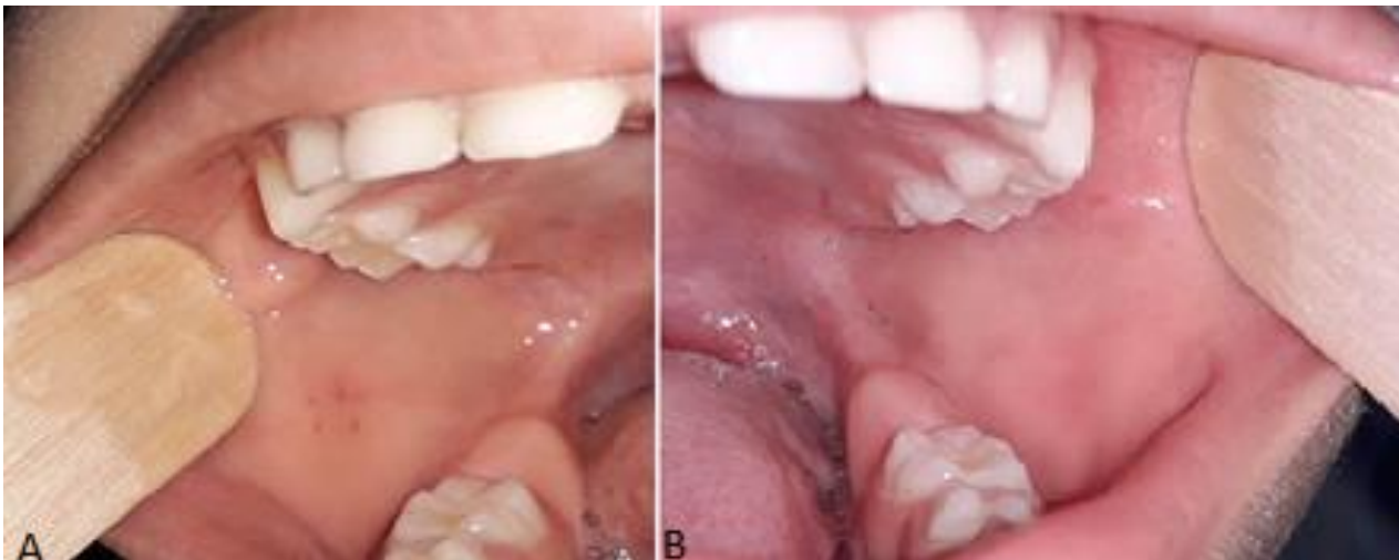
Figure 2: intraoral view showing the absence of caries or other dental anomalies A) right side; B) left side