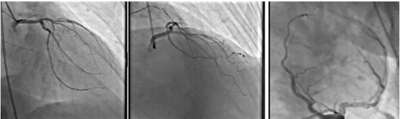
Figure 2: coronary angiogram revealed normal coronary arteries