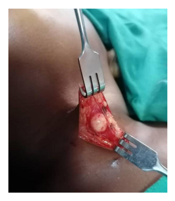
Figure 2 : intraoperative view of the nodule after neck excision