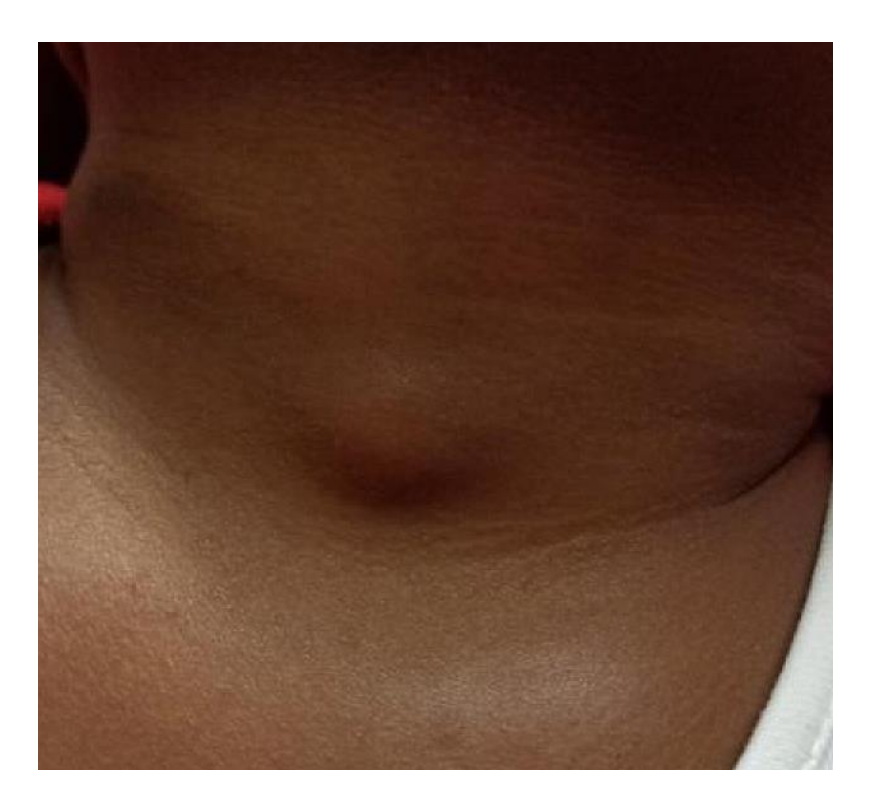
Figure 1: clinical presentation of the nodule