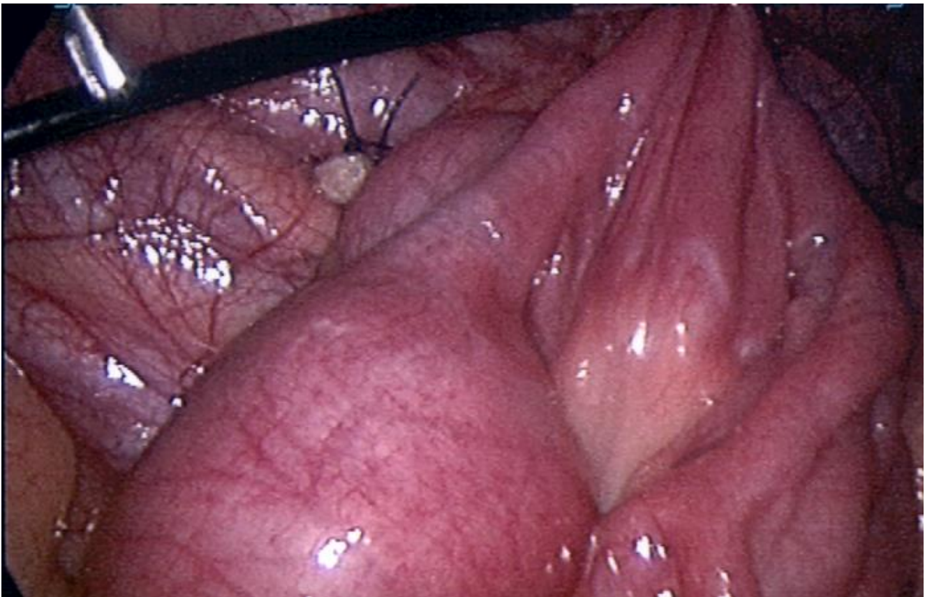
Figure 2: a laparoscopic disintussusception approach was performed, with no signs of ischemia or perforation after the reduction of the small bowel