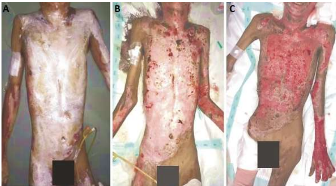
Figure 1: evaluation of clinical status and BMI: A) day 1, BMI 17.57 kg/m 2 ; B) day 28, BMI 12.94 kg/m 2 ; C) day 66, BMI 11.96 kg/m 2