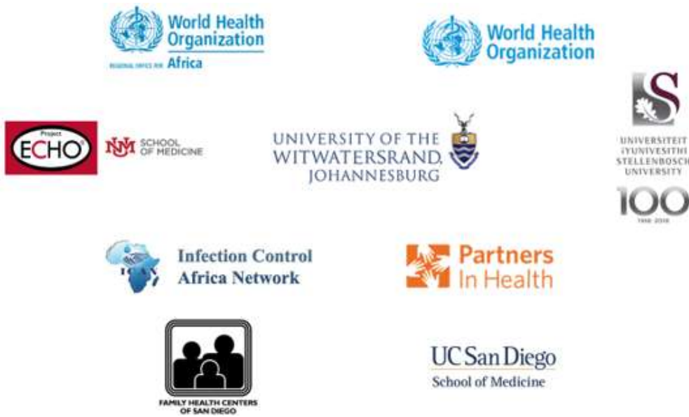
Figure 1: subject matter experts drawn from WHO, universities, technical agencies and other partners in the region and sub region