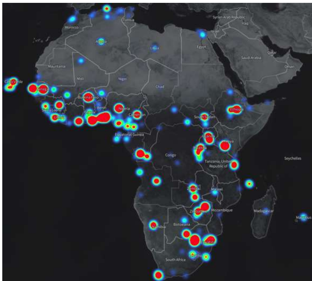
Figure 3: geographical information system map showing the location of participants from Africa for session 4