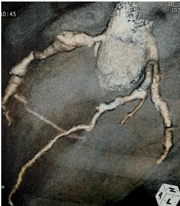
Figure 2: coronary CT angiography revealed multiple coronary aneurysms involving all 3 major coronary arteries