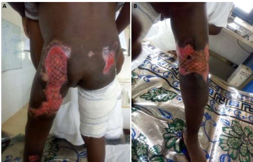
Figure 3: A) ulcers of buttock and posterior face of left lower limb healing after mesh grafting and knee flexion correction; B) ulcers of anterior face of left lower limb healing after mesh grafting