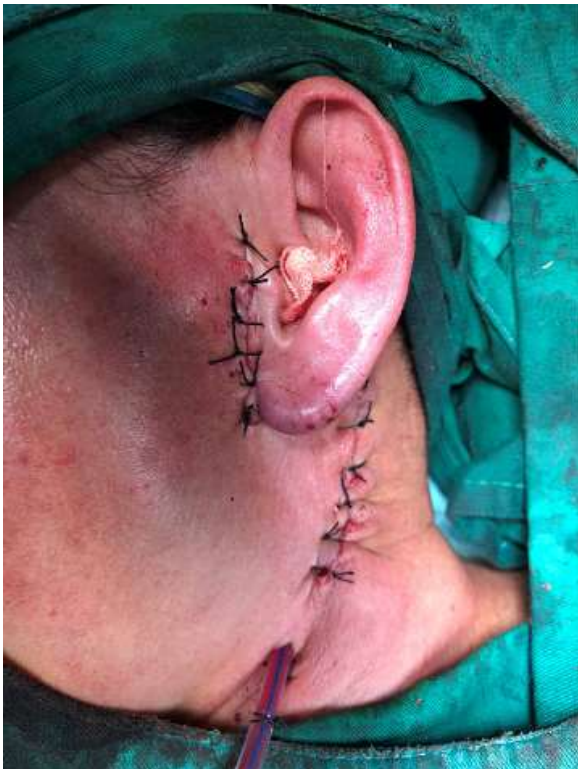
Figure 6: sutured layer with a drainage tube