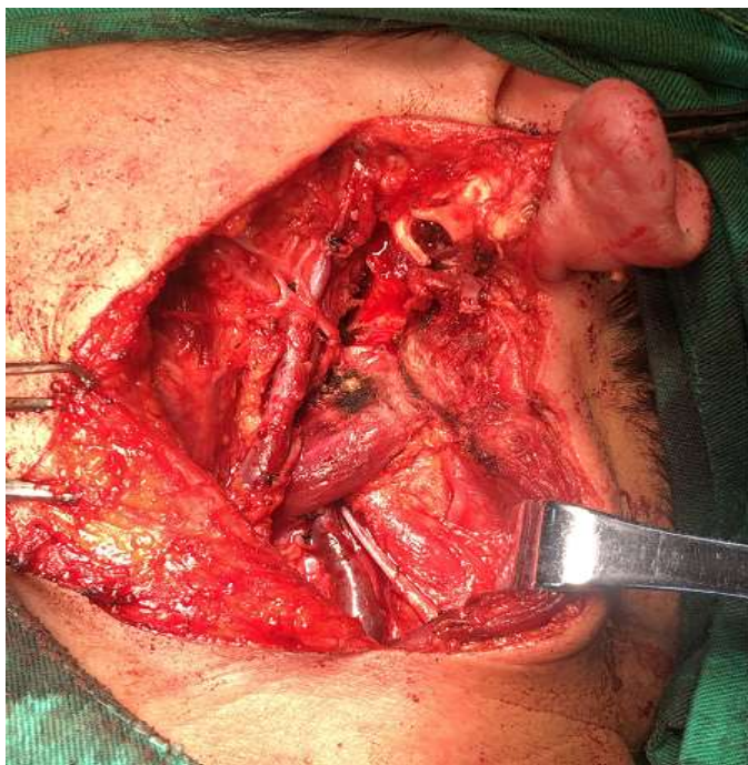
Figure 4: facial nerve trunk exposed and protected