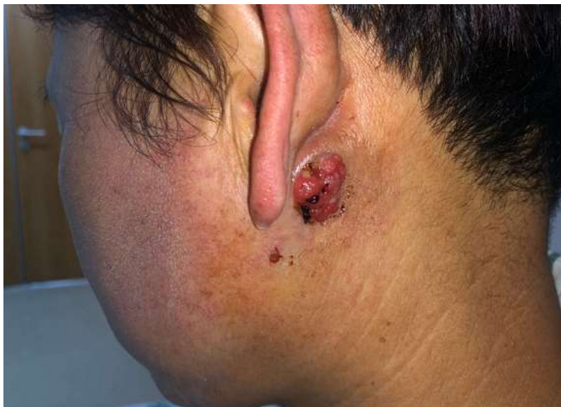
Figure 1: lateral view of the neck showing the left postauricular mass