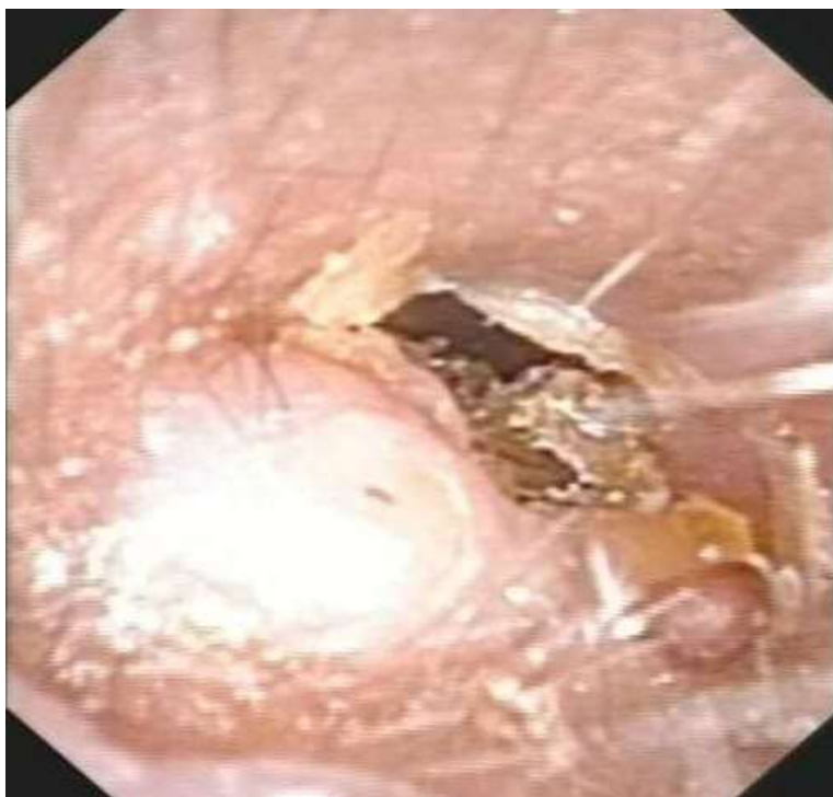
Figure 2: otoscopic findings of the posterior wall of the left auditory canal showing a mass; a normal tympanic membrane was seen