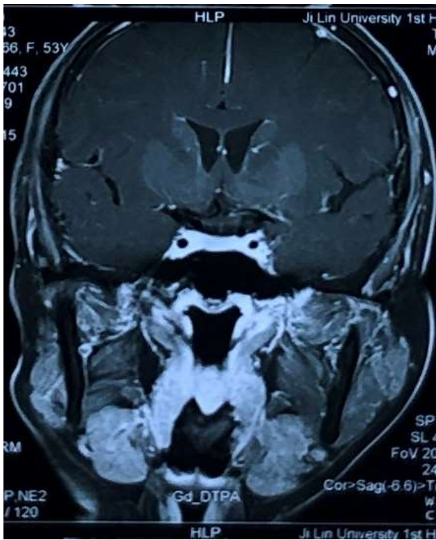
Figure 3: MRI displaying a hypointense lesion