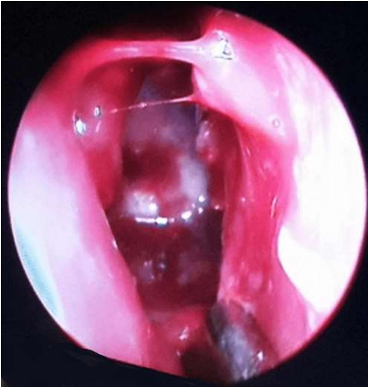
Figure 2: endoscopic view, showing an opening created through the sphenoid anterior ostium by enlarging it