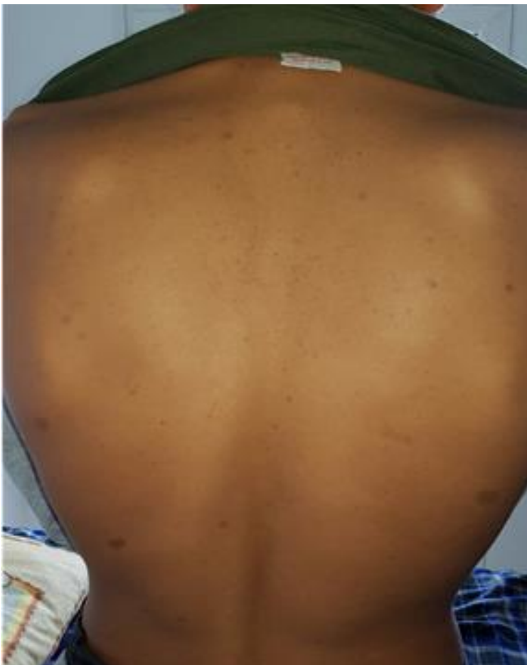
Figure 1: «café-au-lait» macules on the back