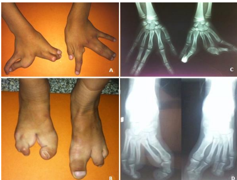
Figure 1: clinical (A, B) and radiological (C, D) features of SHFM phenotypes observed in patient II: 6