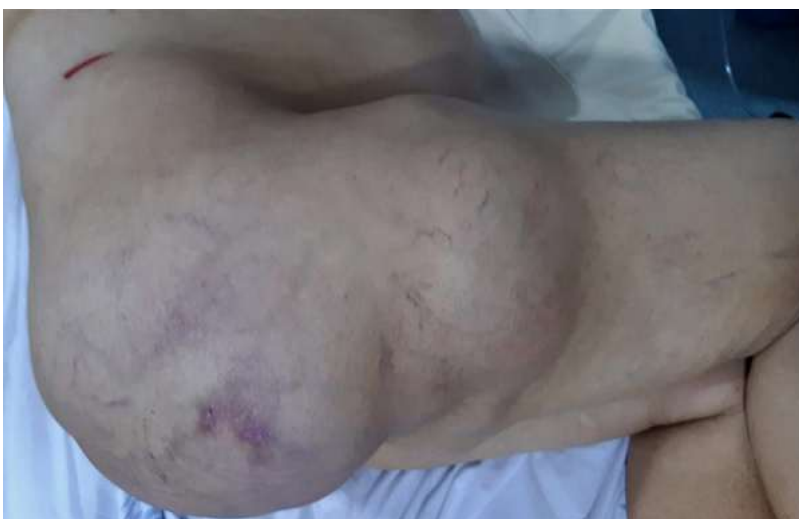
Figure 1: posterior and lateral thigh giant mass