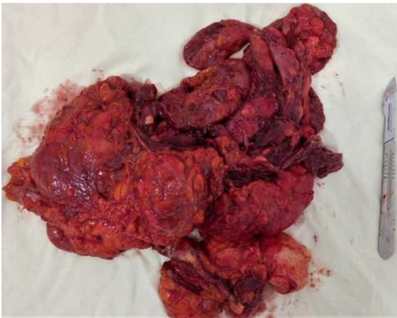
Figure 4: resected specimen