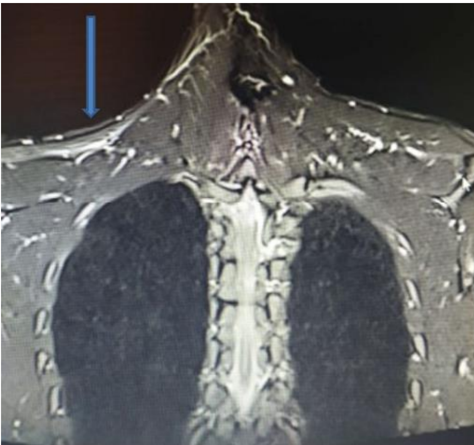
Figure 3: MRI of the brachial plexus, coronal cut in T2 sequence: wasting of the right trapezius muscle with denervation edema