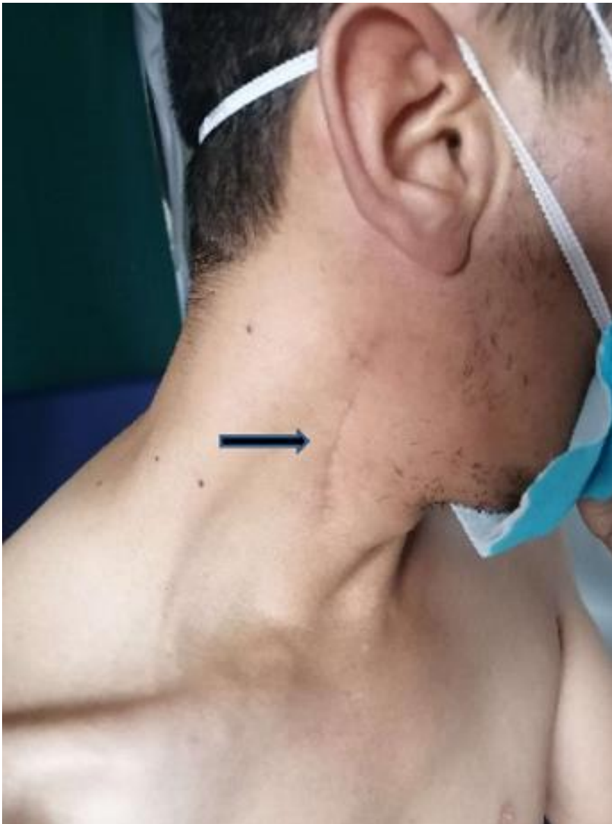
Figure 1: anterolateral scar on the right side of the neck