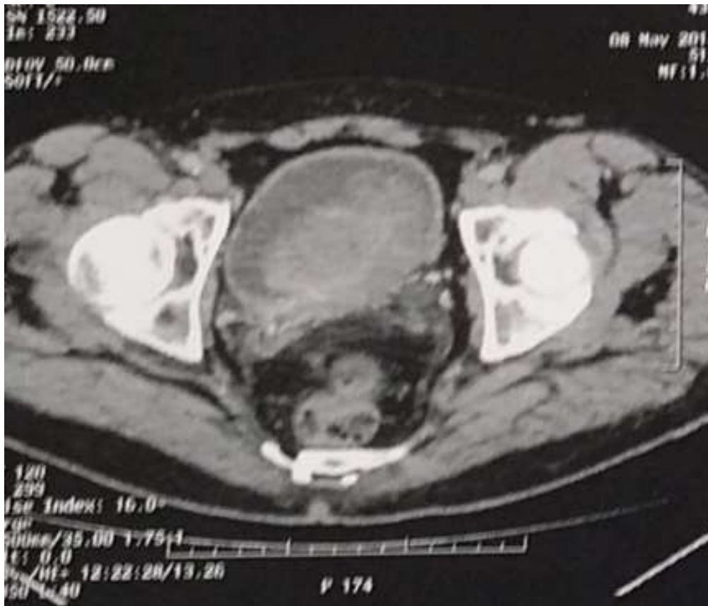
Figure 3: CT scan showing a huge bladder tumor invading the peri-bladder fat classified T3N0M0