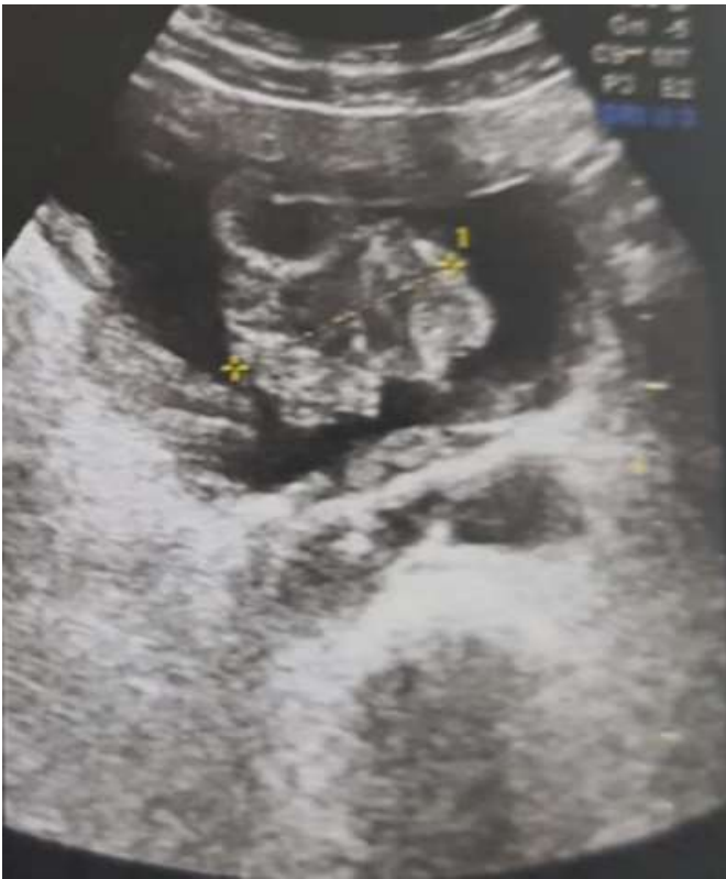
Figure 1: ultrasound showing a parietal mass depending on the anterior surface of the bladder