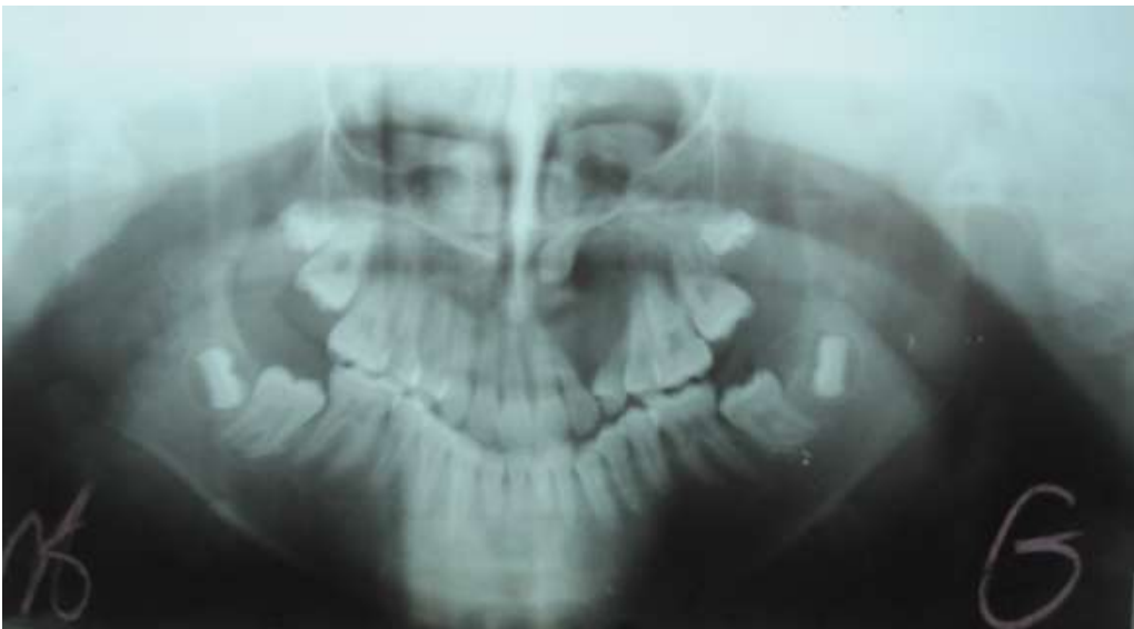
Figure 2: preoperative orthopantomography radiography, showing an expansive lesion of the anterior left maxilla involving the nasal cavity and extending superiorly closely to the floor of the maxillary sinus. The canine is impacted