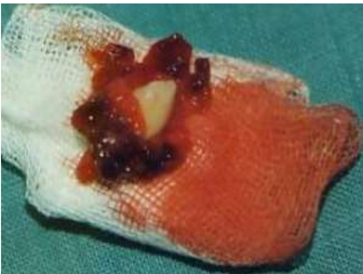
Figure 4: clinical aspect of the lesion