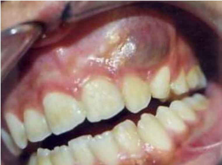
Figure 1: red-purple prominent lesion involving left maxilla that appears swollen and edematous, causing deformity of the jaw