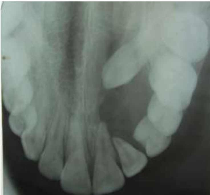
Figure 3: preoperative occlusal radiography