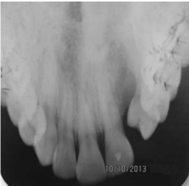
Figure 6: 1 year postoperative follow up showing bone formation