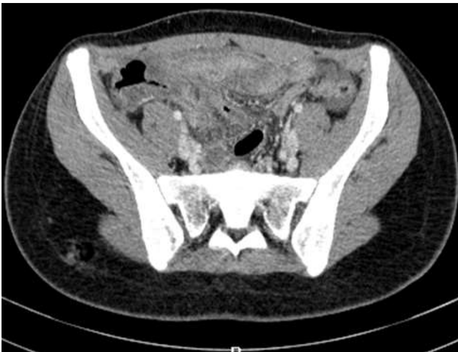
Figure 1: an axial CT scan of abdomen showing inflammatory features surrounding a blind-ending structure arising from the caecum