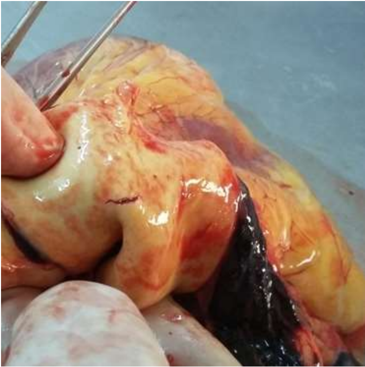
Figure 4: a wound on the inside of the aorta