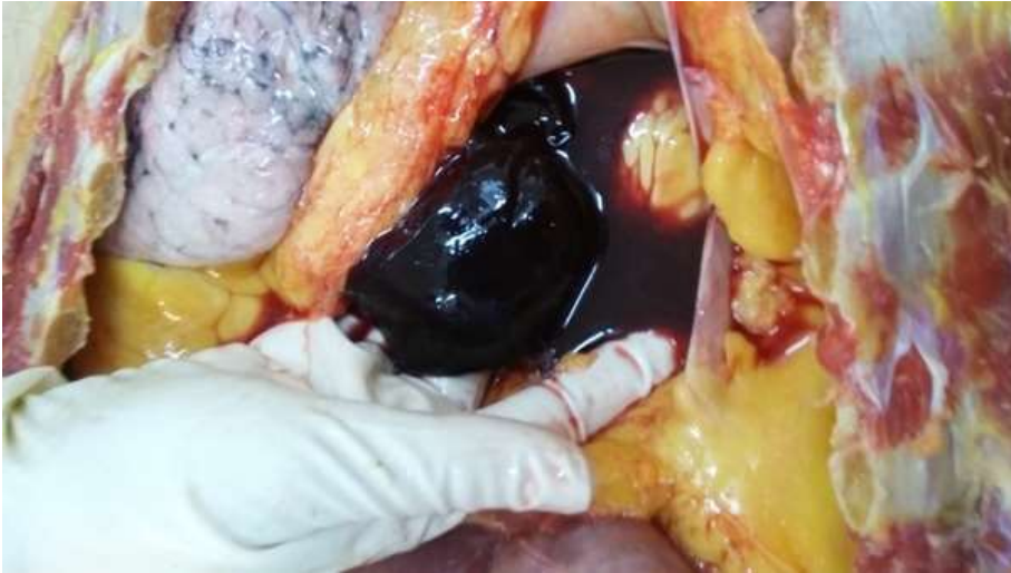
Figure 2: fluid and coagulated blood in the pericardial cavity