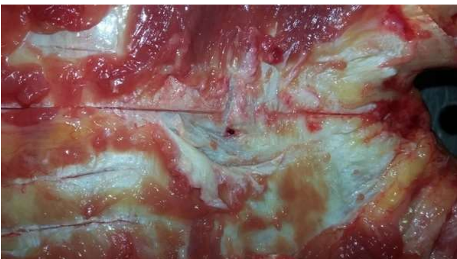
Figure 1: a crossing of the posterior table of the sternum by the trocar