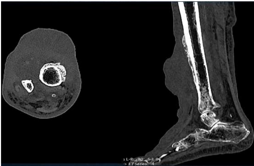
Figure 3: computerised tomography (CT) axial and sagittal reconstruction images of the same patient shows areas of soft tissue edema, heterogeneous linear densities and few areas of faint calcification in the region of the lobulated skin lesion; thick unicortical periosteal reaction of the tibia for a short segment; adjacent to the lesion is noted