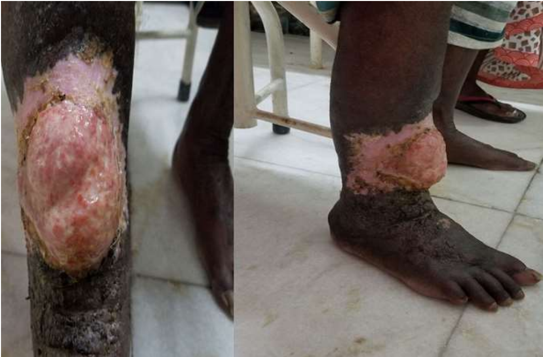
Figure 1: clinical photography of the right leg shows a well demarcated erythematous firm lesion with surrounding nodular areas peripherally and accompanying lymphedema of the entire leg and foot