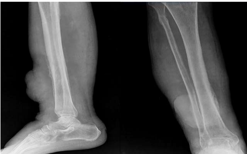
Figure 2: X-ray anteroposterior and lateral projection of the right leg shows a lobulated soft tissue swelling in the anterior aspect of the lower one third of the leg with few calcific areas within and associated periosteal reaction the adjacent bones of the leg