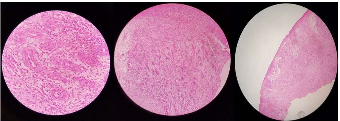
Figure 6: histopathological examination of the biopsy specimen shows stratified squamous epithelium below the dermis, consistent with tumor tissues and shows proliferation of spindle cells around the blood vessels with individual spindle cells showing nuclear atypia and mild hyperchromatosis; they also form slit like, spaces and show a few inflammatory cells; features suggestive of low grade sarcoma - Kaposi sarcoma