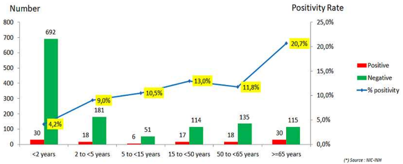
Figure 3: positive rate per age range of SARI cases, all-season combined (2016/2017 and 2017/2018 season)