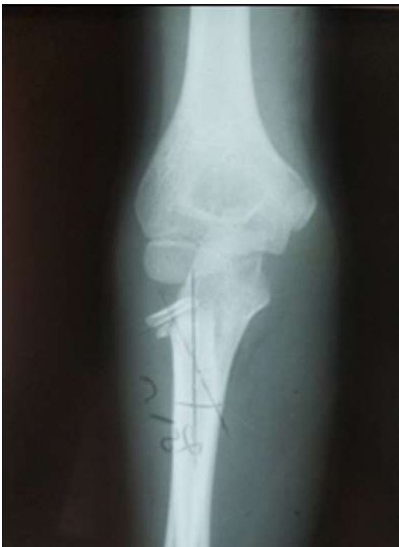
Figure 4: epiphyseal separation fracture type II of Salter and Harris