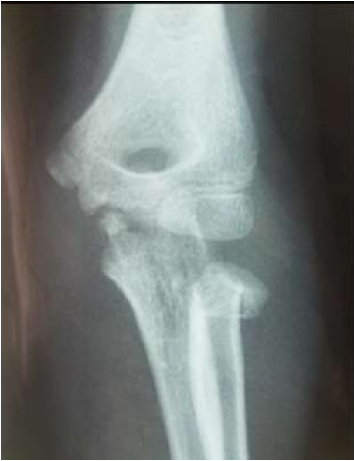
Figure 3: Metaphyseal fracture of the radial neck