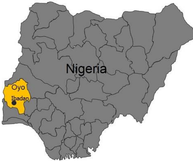
Figure 1: map of Nigeria showing the study area