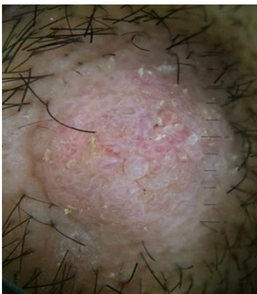
Figure 2: dermoscopic examination showed sharp demarcation, hairpin vessel and milia-like cyst