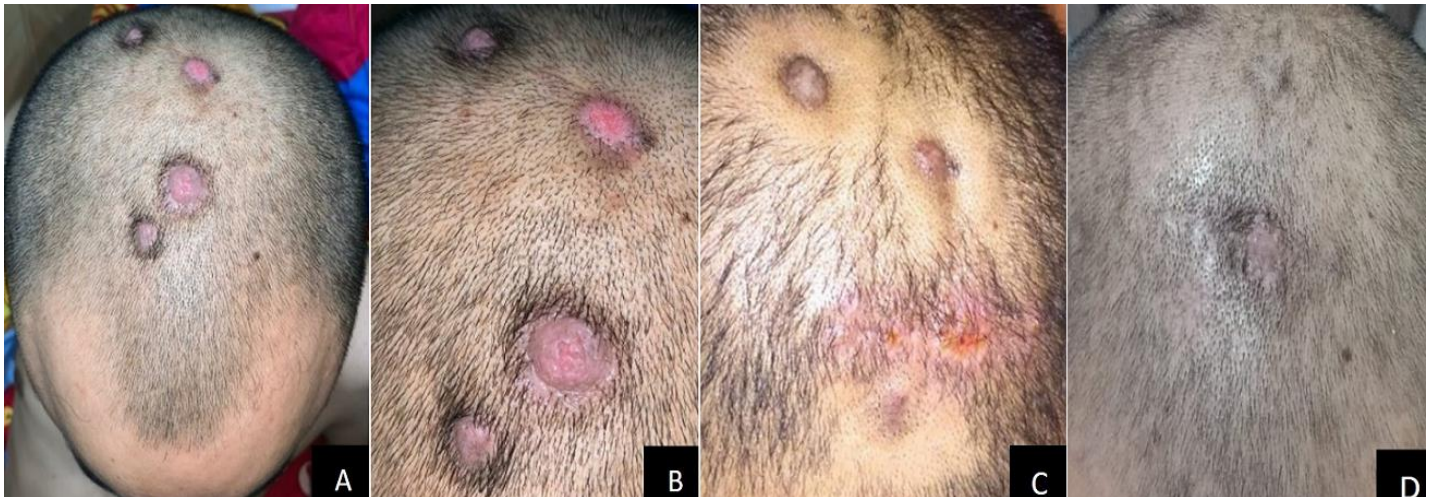
Figure 1: multiple well-circumscribed erythematous nodular hyperkeratosis on scalp (A, B) scar post excision appear closed and the other lesion showed thinning with minimal hyperpigmentation plaque. Four months post-treatment, further significant improvement of the lesions was evident, leaving only minimal hyperpigmentation macules without alopecia (C, D)