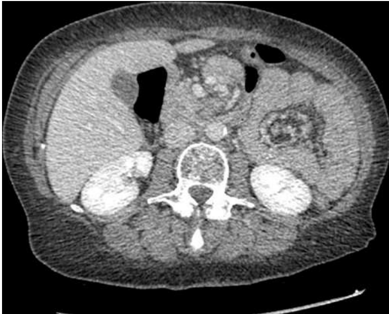
Figure 1: CT scan demonstrated a “twist” in the mesentery with “whirlpool sign” of the jejunum

ischemia, no resection being required. The Petersen's space was closed with a suture. The post-operative period was unremarkable and the patient was discharged at the fourth post-operative day.