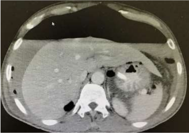
Figure 3: CT Scan was 2 days after omental Graham patch operation, showing massive hydro pneumoperitoneum