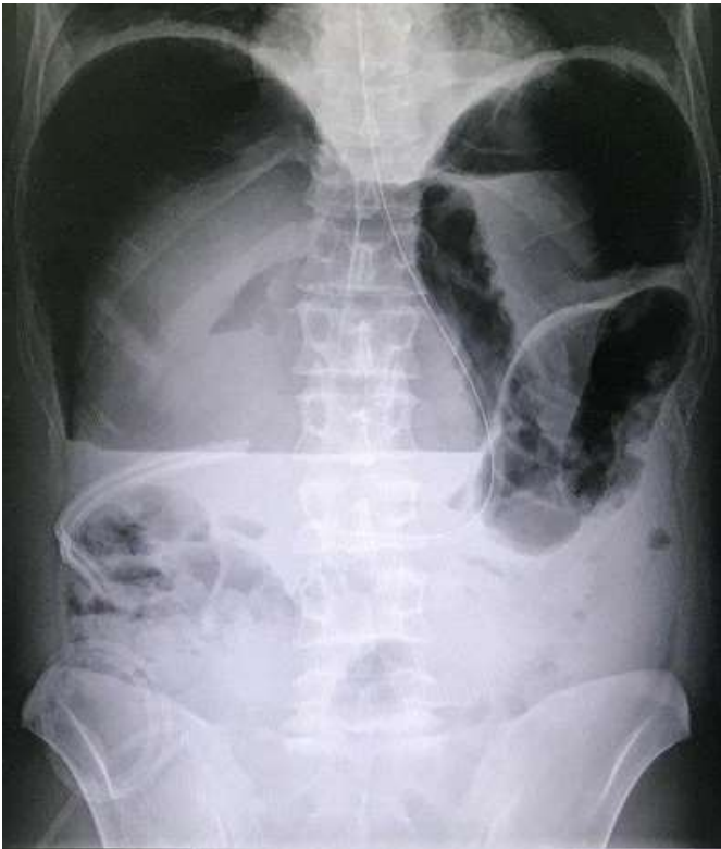
Figure 2: second X-ray was 2 days after the first operation i.e. omental Graham patch operation, which showed a significant huge hydro pneumoperitoneum