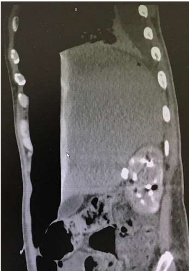
Figure 4: CT Scan was 2 days after the first operation, omental Graham patch operation, showing massive hydro pneumoperitoneum