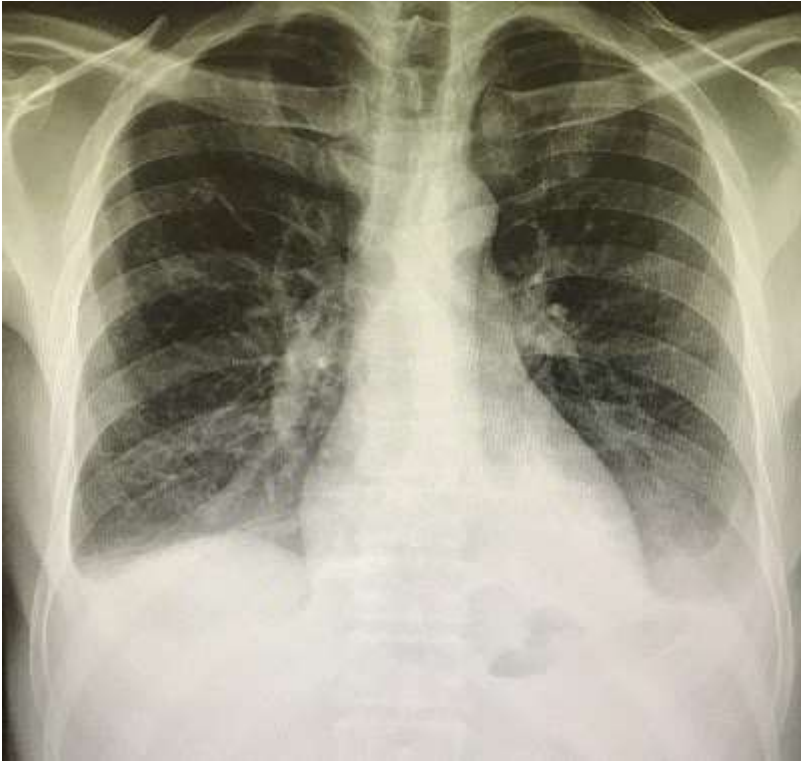
Figure 5: third X-ray was 6 days after the second operation, omental buttressing, that showing no air or fluid in abdominal cavity