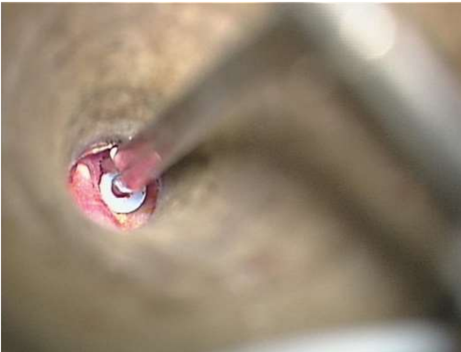
Figure 4: per-operative view showing extraction of the tympanostomy tube