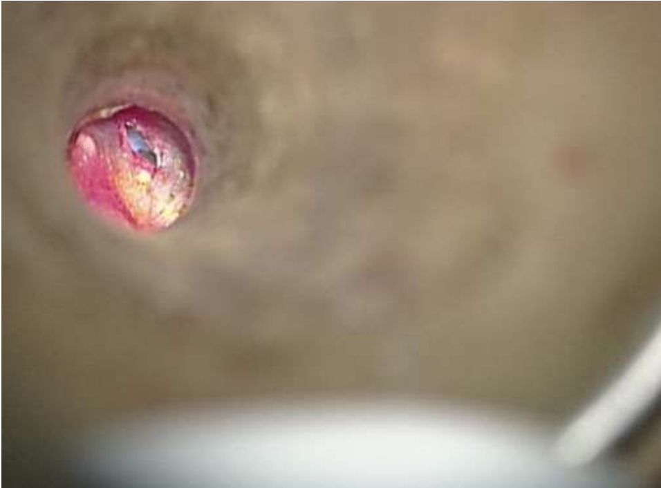
Figure 3: per-operative view showing the presence of the tympanostomy tube in the middle ear left through a myringotomy incision