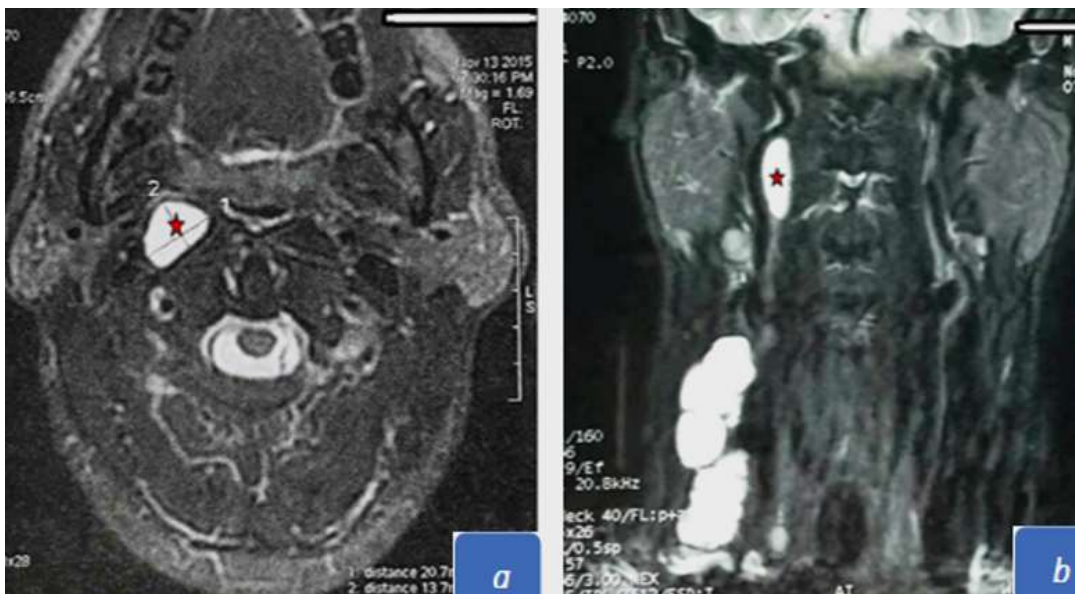
Figure 2: MRI showing enhanced lymph node swelling in the right retropharyngeal space which doesn't dislocate the internal carotid artery; a) axial T2 weighted with fat-suppressed; b) coronal T2 weighted with fat-suppressed