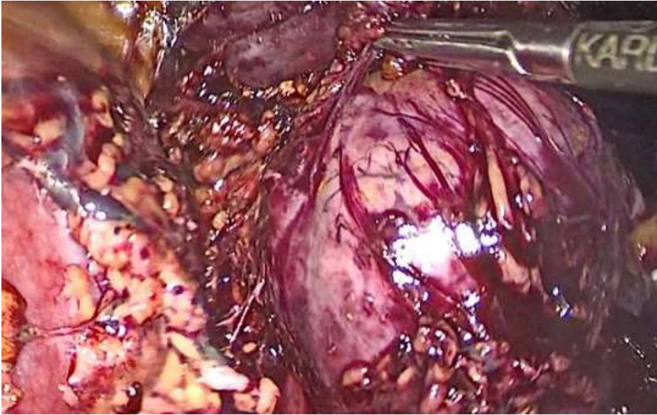
Figure 3: laparoscopic adrenalectomy