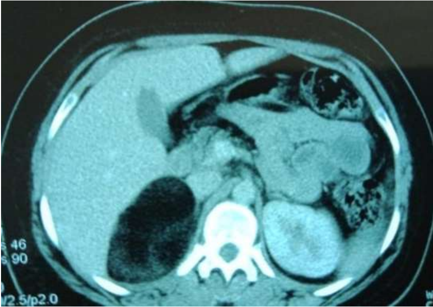
Figure 1: CT scan image showing heterogenous fatty masses 8.35 × 5.73cm with negative attenuation value (-112 HU) in a right adrenal mass