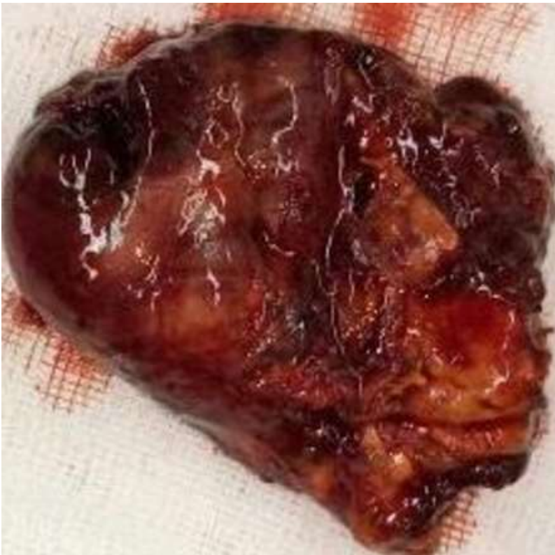
Figure 4: right adrenalectomy specimen