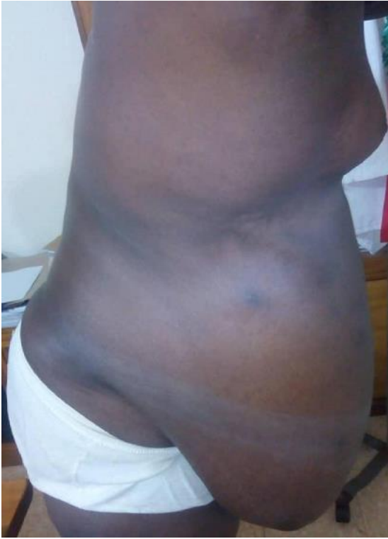
Figure 3: divers view (pre operative)