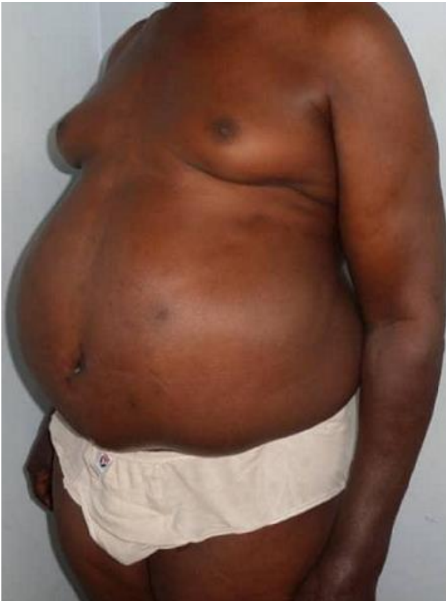
Figure 6: left anterior oblique view (post operative)