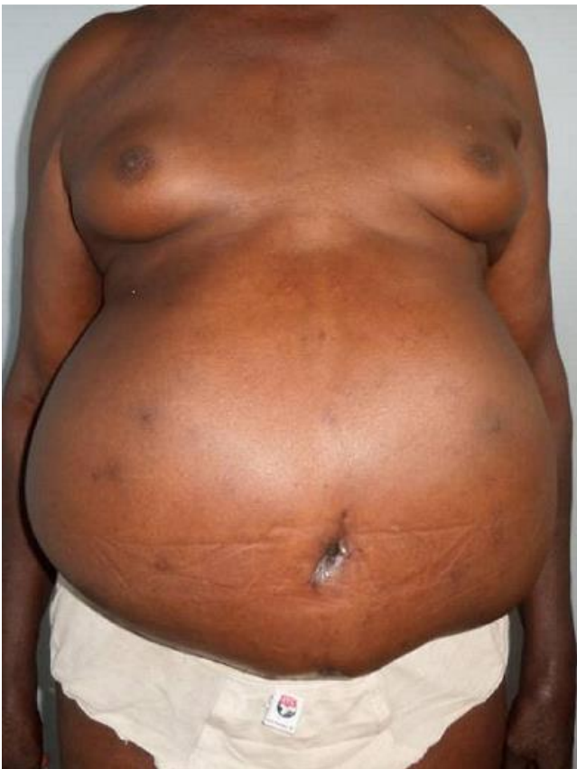
Figure 2: antero posterior view (post operative)