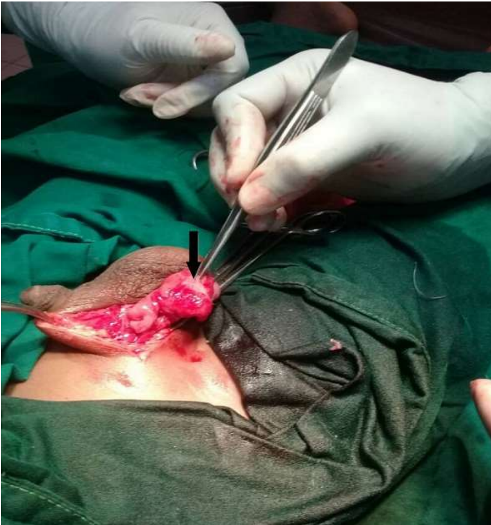
Figure 1: showing thickened gubernaculum and testis