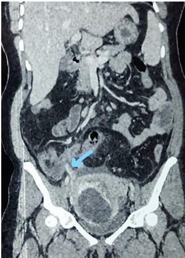
Figure 1: Coronal reconstruction showing complicated acute appendicitis and pregnant uterus