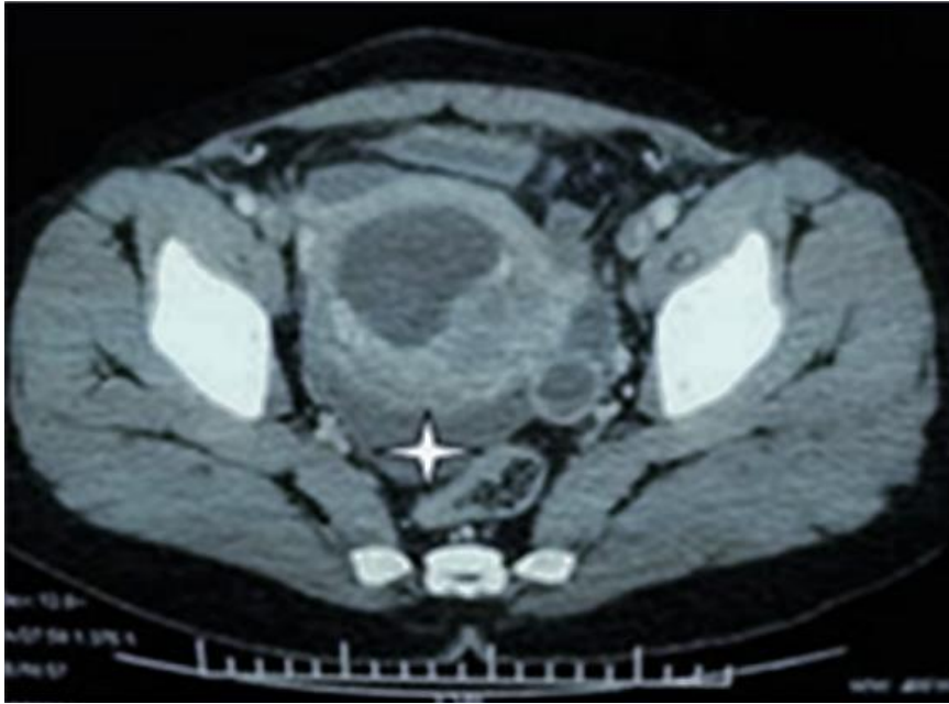
Figure 2: Abdominal CT showing acute appendicitis during pregnancy Douglas abscess complicating acute appendicitis