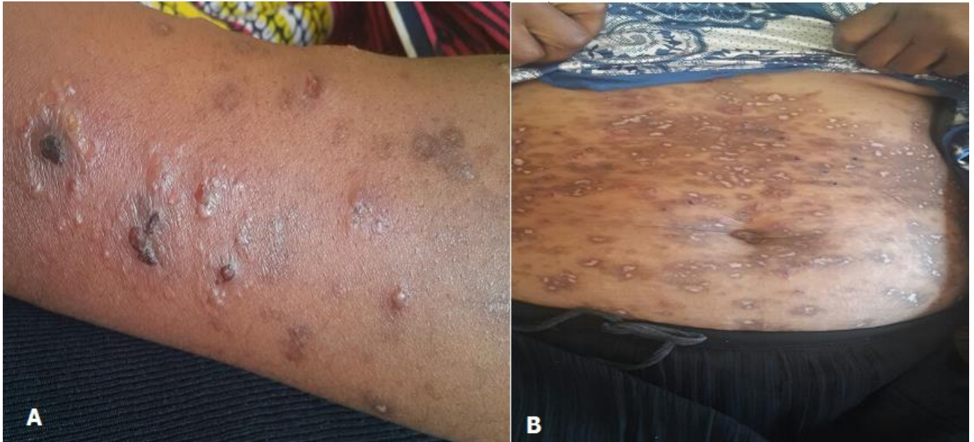
Figure 1: A) grouped vesicles on the forearm; B) healed lesions on the abdomen showing post inflammatory hypo- and hyper-pigmentation