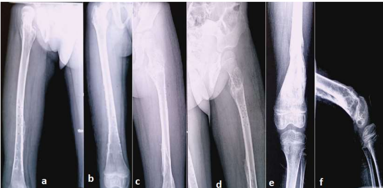
Figure 5: (A) eight months after the injury, anteroposterior (AP) and lateral views of right femur showed that the fractures were healed; (B) AP and lateral views of left hip and knee showed that the left proximal femoral fracture; (C) and the left distal femoral fracture were united