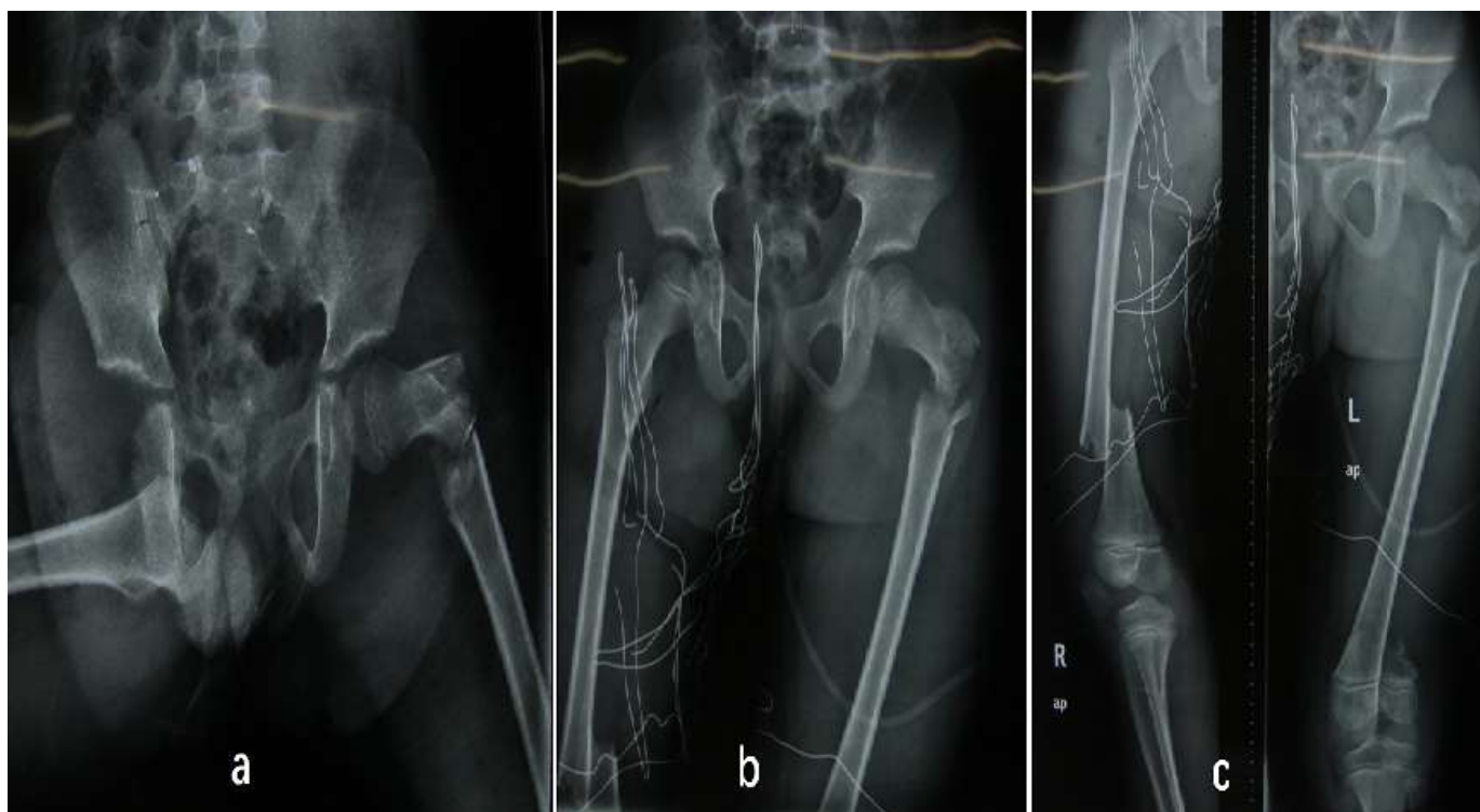
Figure 1: (A) the right femoral head was dislocated anteroinferiorly with a displaced contralateral proximal femoral fracture; (B) the right dislocated hip was reduced; (C) as shown in the anteroposterior (AP) view of pelvic. AP view of femurs shows the right transverse femoral shaft fracture and proximal and distal femoral bifocal fractures of the left femur