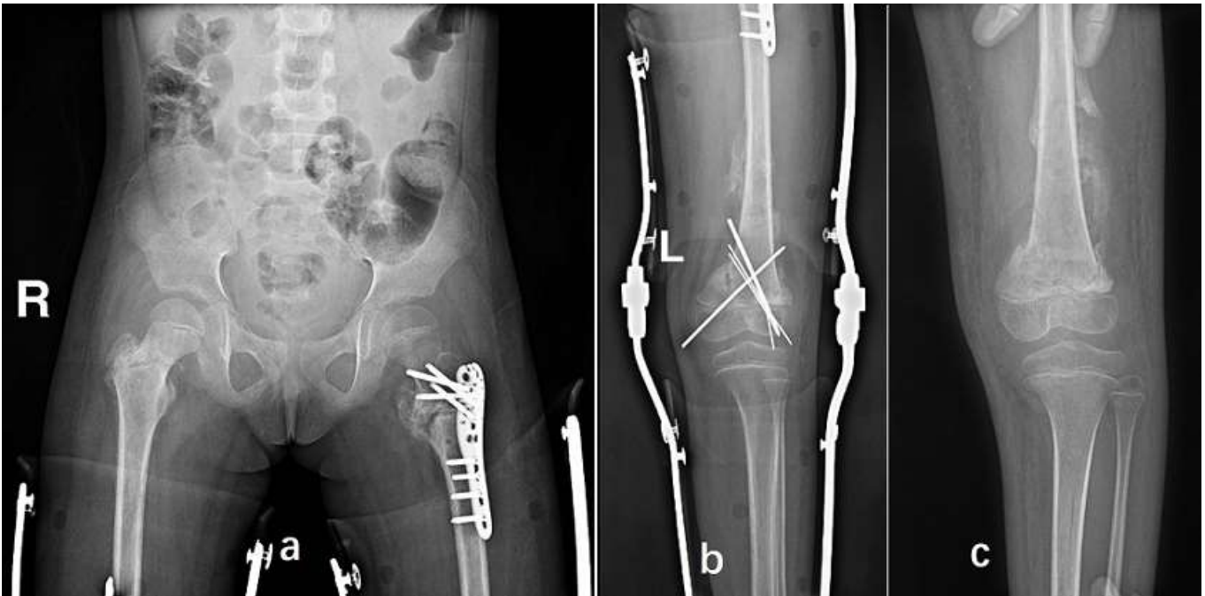
Figure 3: (A,B) three months after the injury, the fractures healed well as shown in the pelvic view; (C) the Kirschner wire was removed from the left distal femur