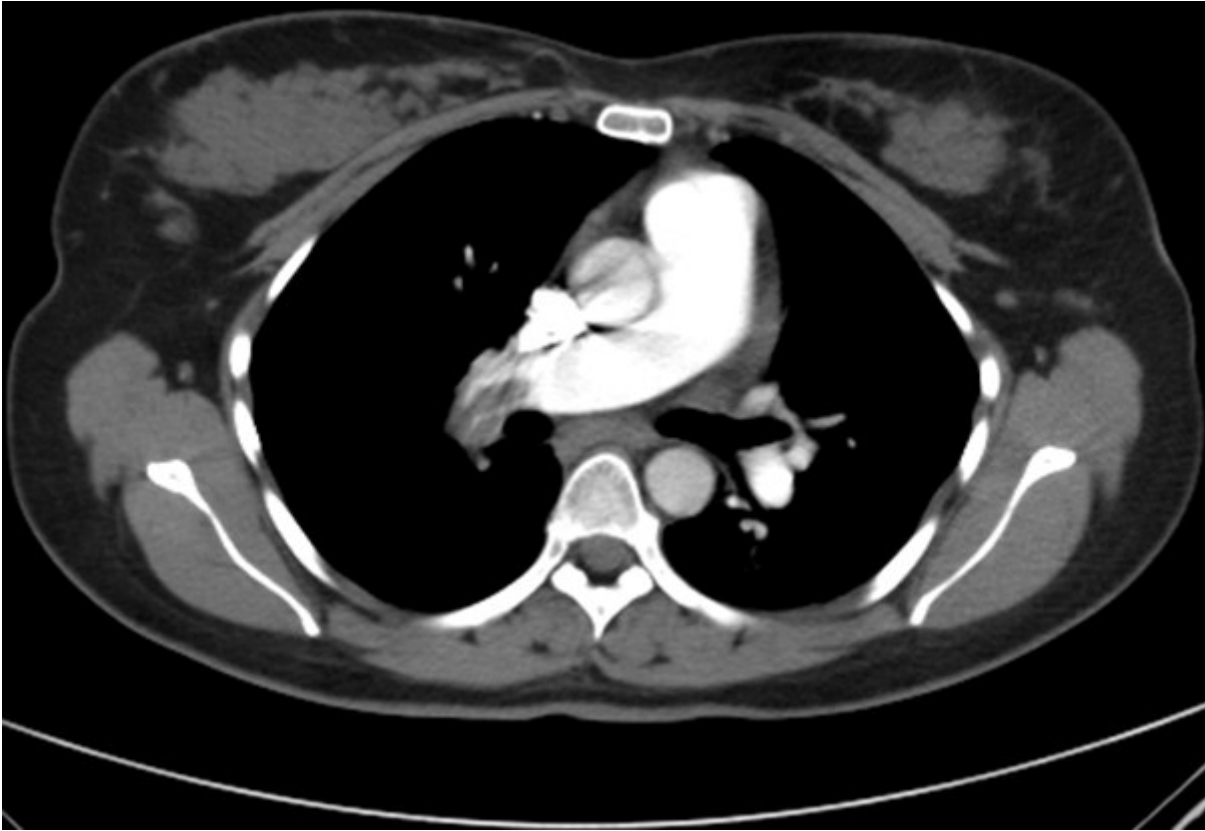
Figure 2: CT-Scan chest with contrast showing bilateral sub-massive pulmonary emboli