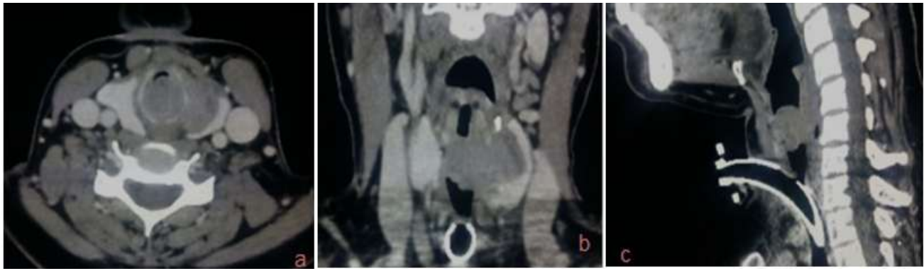
Figure 1: contrast-enhanced cervical computed tomography: axial (A), coronal (B) and sagittal view (C): tumoral lesion between the left thyroid lobe, the left edge of the subglottic area of the larynx and the first tracheal ring filling all the lumen. The origin could be either the thyroid gland or the larynx