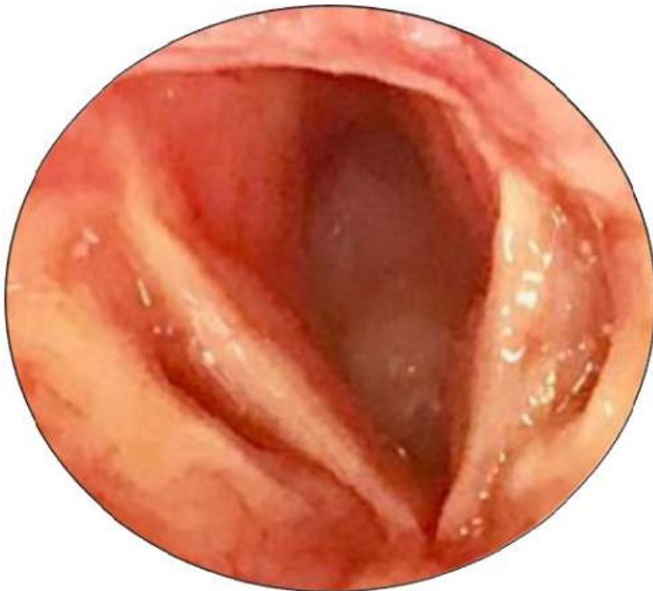
Figure 2: endoscopic view of the larynx showing a subglottic obstructive tumor which respects the arytenoids, the vocal folds and the hypopharynx