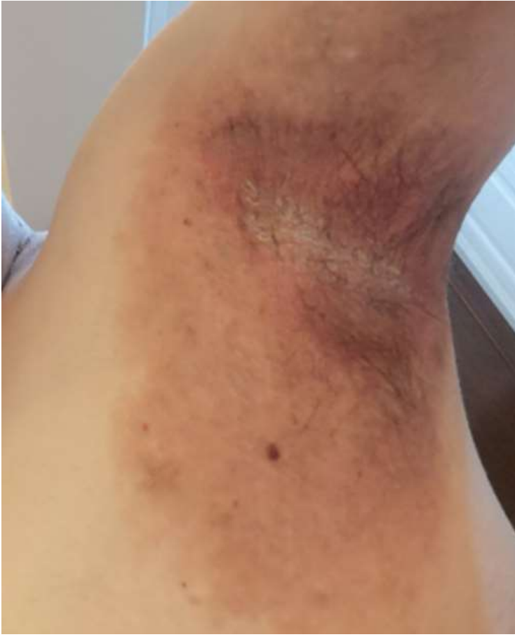
Figure 4: left axilla of the HHD patient after 3 months on azathioprine. There is some post inflammatory pigmentation and crusting and scaling in the central region of axilla