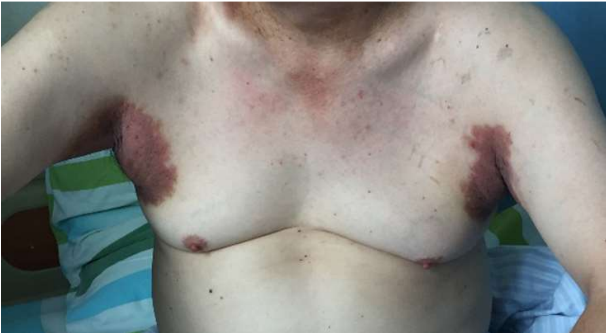
Figure 1: bilateral axilla showing erythematous lesions with associated erosions, some fissuring, crusts, pigmentation and scale at friction sites in a patient with HHD