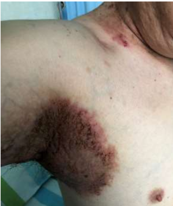
Figure 3: day five post treatment with azathioprine, indicating healing erythematous axilla with some healing fissures, crustations and scaling