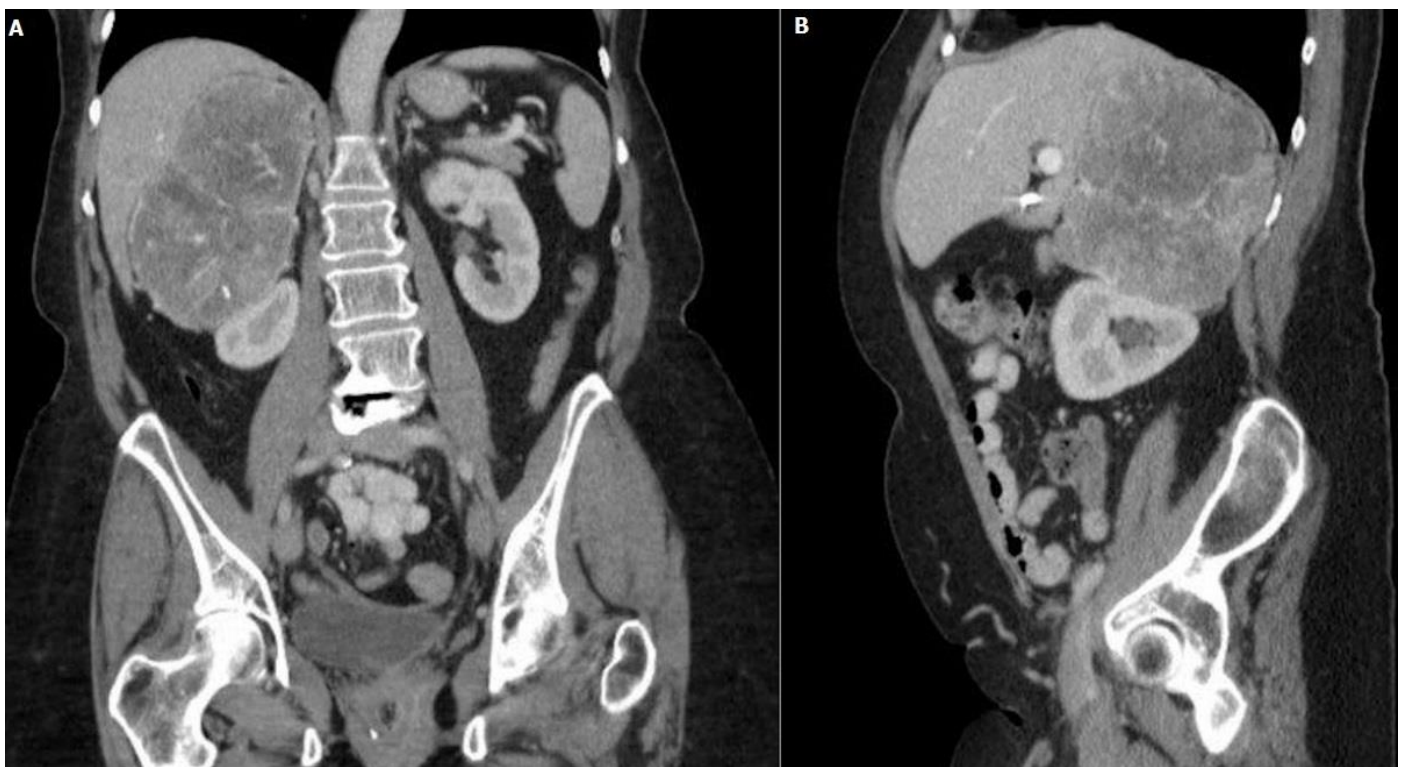
Figure 1: CT abdomen: (A) coronal section showing 8cm mass above the right kidney; (B) sagittal section showing the adrenal tumor