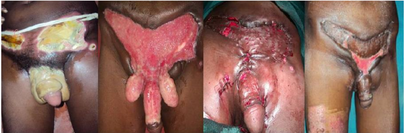
Figure 3: SSG + implantation of testis in thigh for extensive skin loss