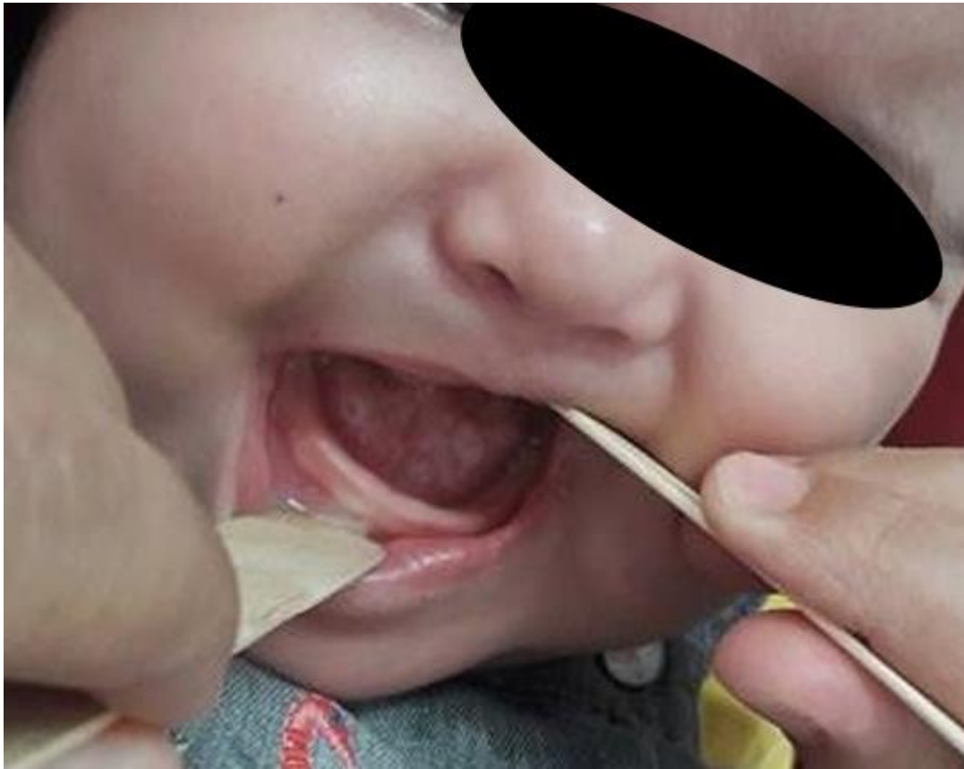
Figure 3: Clinical aspect eight months after transoral resection