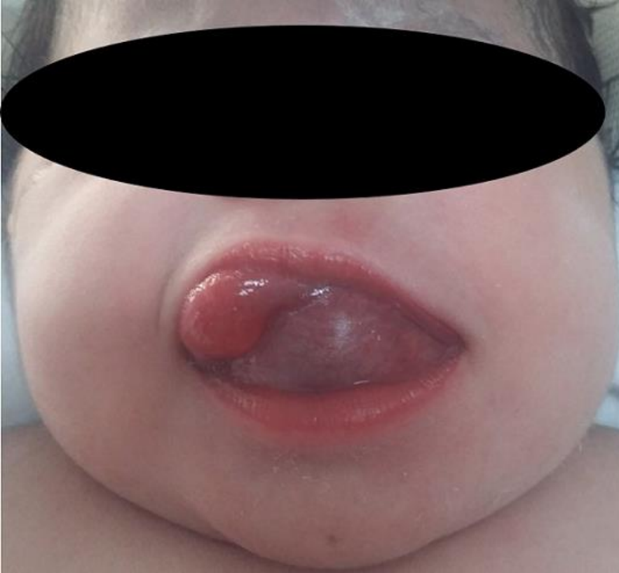
Figure 1: Lingual mass at clinical examination