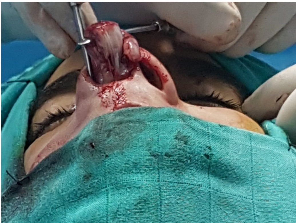
Figure 5: extraction of the rhinolithe from back to front with a hook