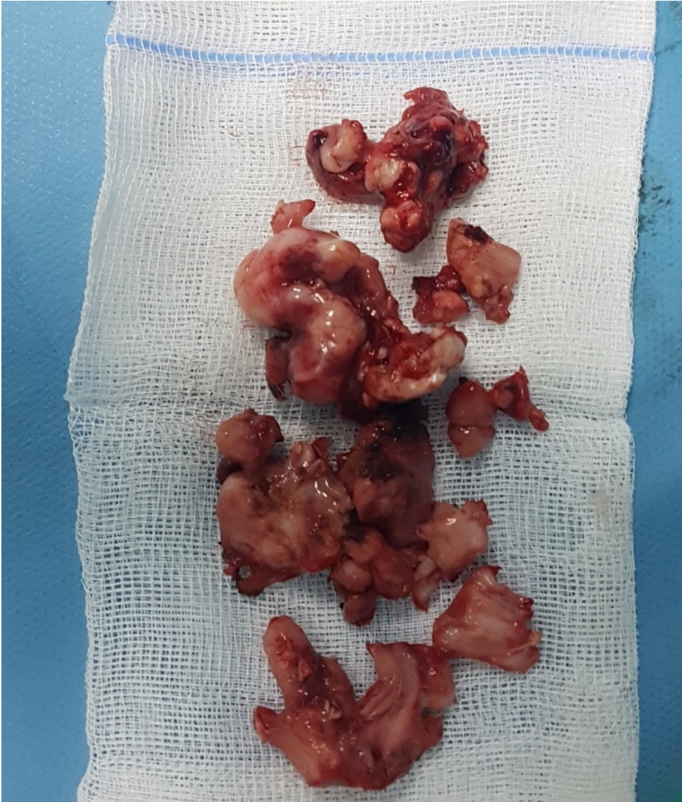
Figure 7: image of extracted rhinolithiasis rounded by granulation and inflammatory tissue