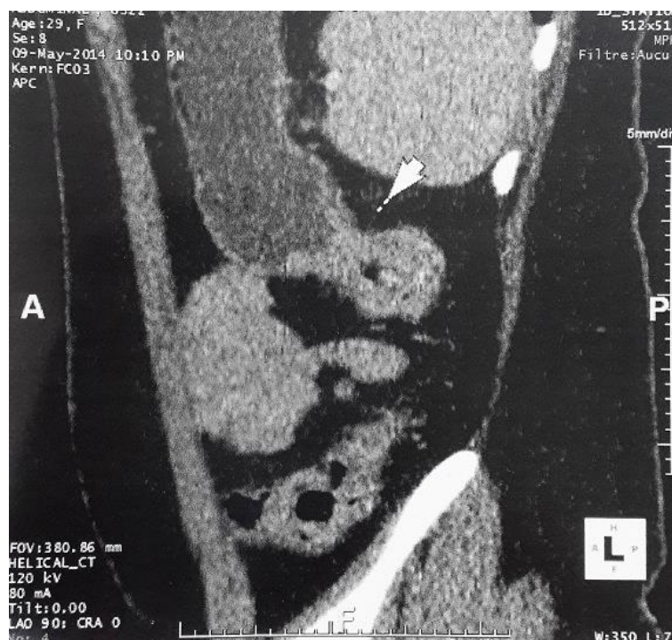
Figure 1: Abdominal CT scan showing irregular parietal thickening of the descending colon with important dilation of the colon upstream