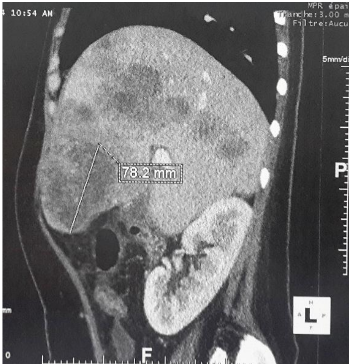
Figure 2: Abdominal CT scan demonstrating multiple enhancing hypodense lesions of the liver