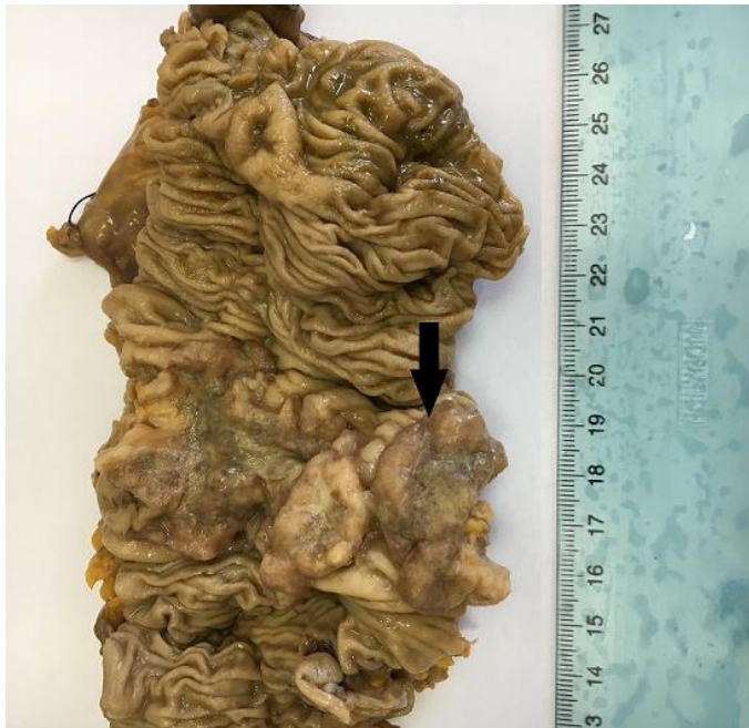
Figure 3: Gross findings of colonic adenocarcinoma: exophytic tumour with intraluminal growth (black arrow)