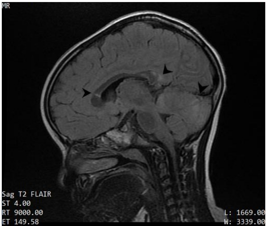
Figure 2: sagittal T2 FLAIR High signal changes indicating diffuse axonal injuries in corpus callosum, cerebellar, and basal ganglia of the right hemisphere