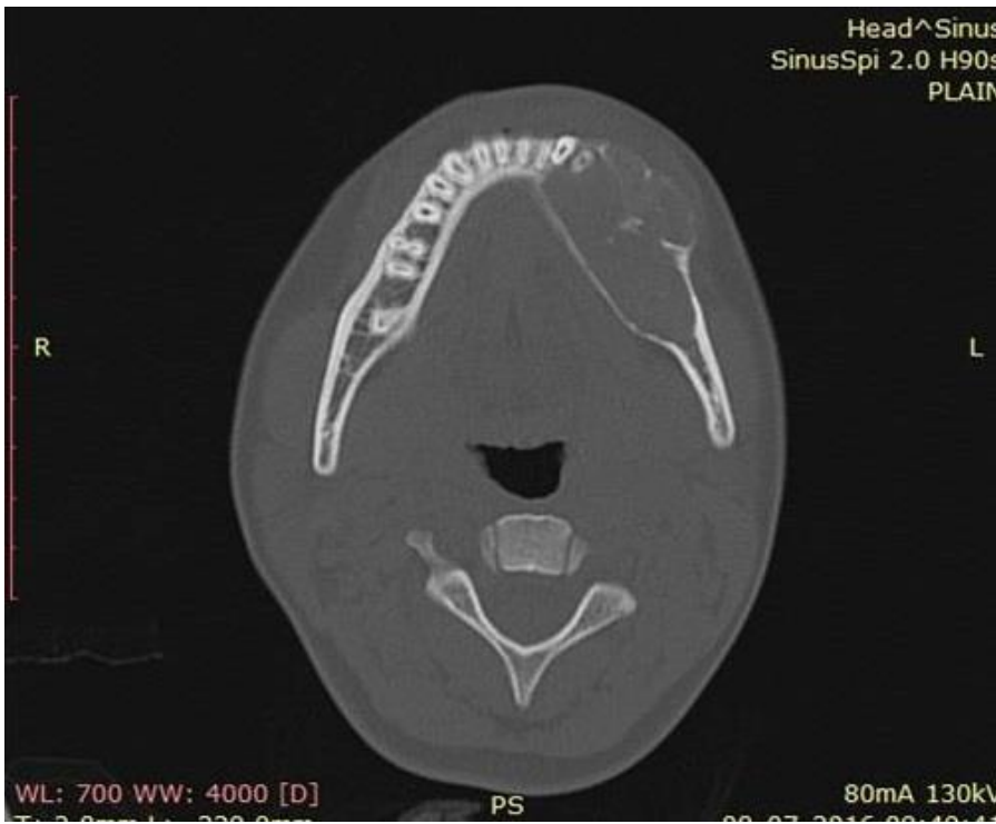
Figure 3: Computed tomography view