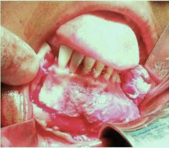
Figure 4: Incision and exposure