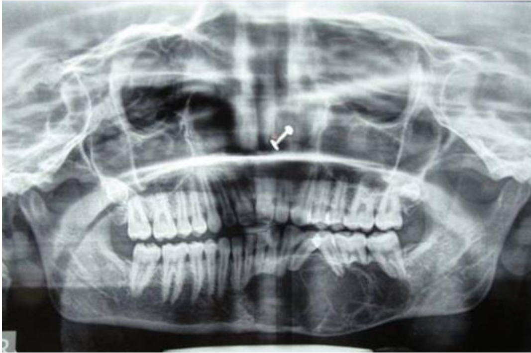
Figure 2: Panoramic view