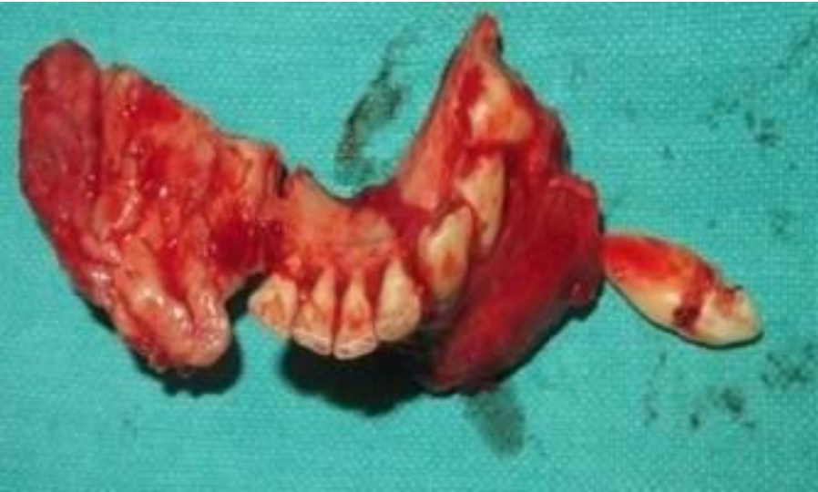
Figure 5: Resected specimen