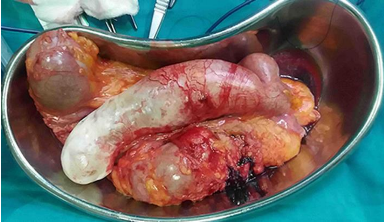
Figure 2: Surgical specimen