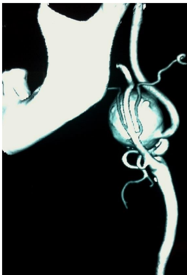
Figure 1: Reconstructed angio-CT scan showing a saccular aneurysm originating from the proximal left ICA