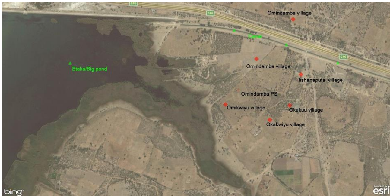
Figure 2: A satellite map showing the water canal and villages of cases in Omusati region with Schistosomiasis cases, March 2016