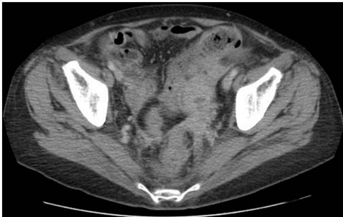
Figure 1: Abdominal CT scan demonstrating a sigmoid tumor like mass